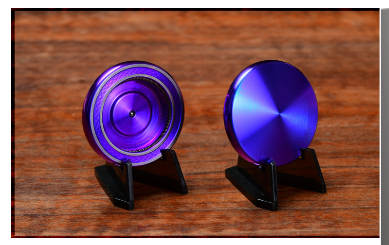
Titanium electro anodized to a blurple color