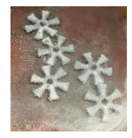
Acid etching Spiro Damascus